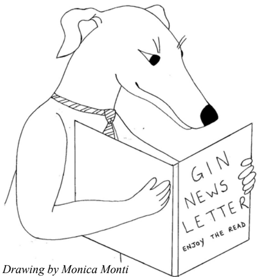
Drawing by Monica Monti